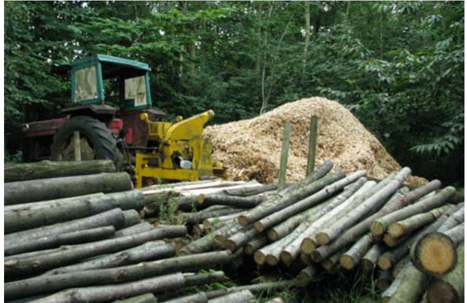
Local Timber Producers Group: A meeting for producers and contractors in the Wealden and Rural Rother area on Friday 26 th September at WEC, Flimwell. For further details see page 4.