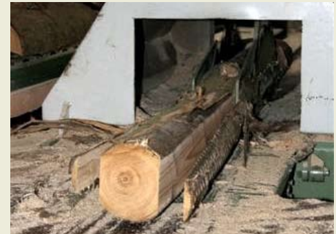
The 'double slabber' saw squaring off timber as the first part of the milling process at the Biowoodlands timber yard.

standing timber; it also has the potential to increase their value for landowners. In this way it also fulfils an overall aim of the SEWTF funding by providing an economic incentive for the more active management of underutilised timber resources within the South-East.