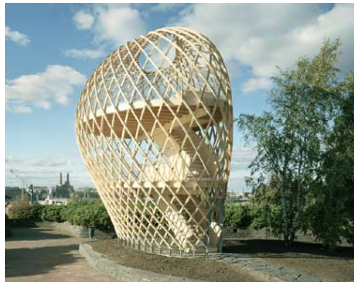
Kupla Bubble Lookout Tower