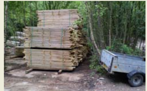
Stacks of sawn timber at the Biowoodlands yard. For more details see the article right.