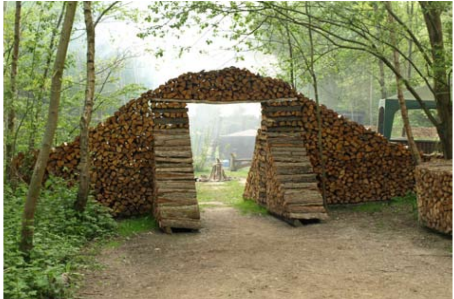
Log Arch: Drying Alder for charcoal making at Ingram's Copse in West Sussex. See page 11 for further details about Didling Good Charcoal and Ingram's Copse.